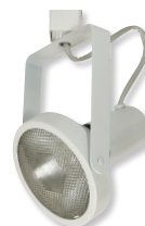
NTH-108W/A White Finish