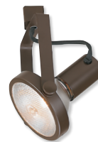
NTH-108BZ Bronze Finish