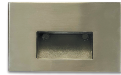
NSW-740BN Brushed Nickel