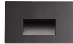
NSW-740DBZ Deep Bronze