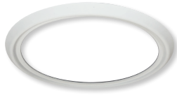
Onyx Oversize Ring